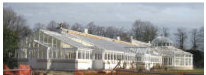
The Camellia House restoration nears completion