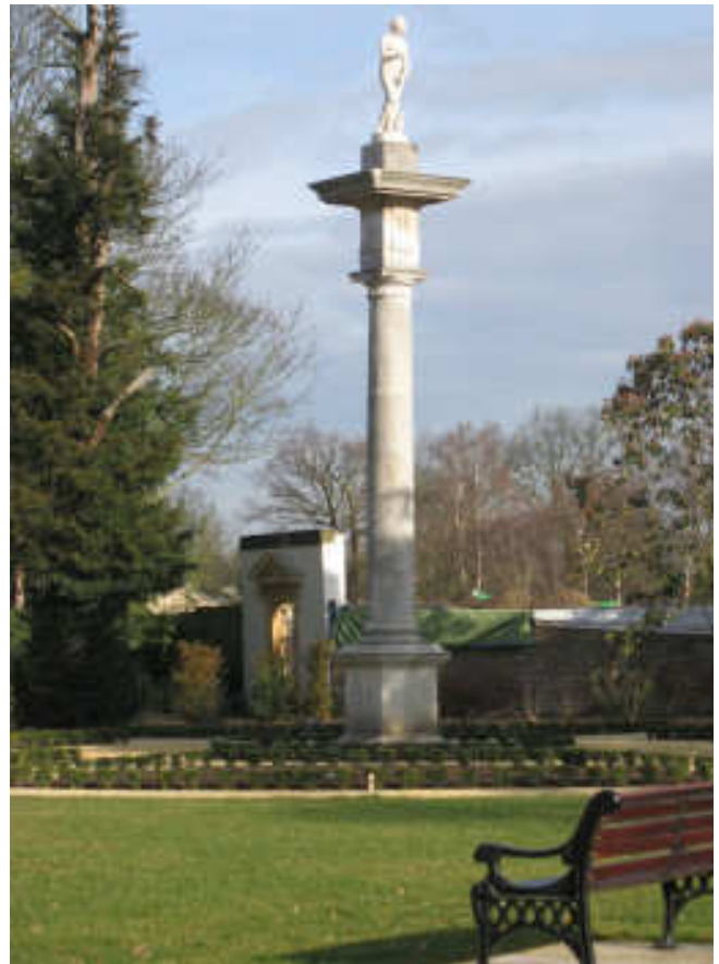
The Rosary Garden and Venus