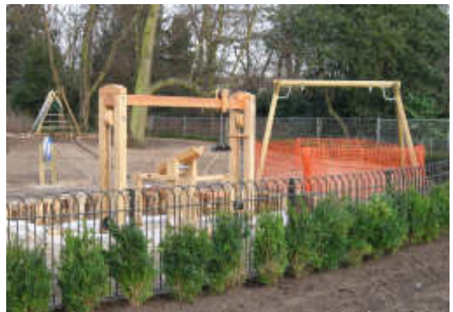
Some of the new playground equipment by the cafe