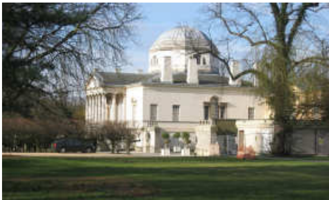
The restoration has opened up unfamiliar views of the House